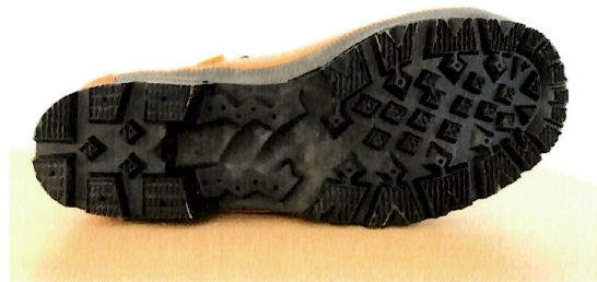
Rubber outsole (96950)